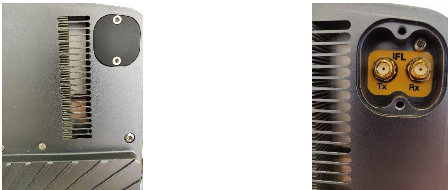
Figure 1 Shows plastic cover on backside of antenna on the left. On the right is the SMA connectors underneath the cover.