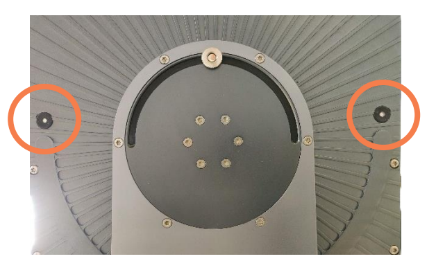
Figure 4 Protective vents on backside of antenna.