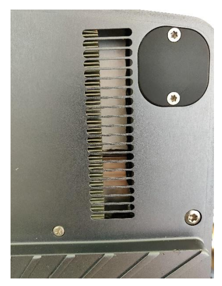
Figure 3 Air exhaust at the backside of antenna.