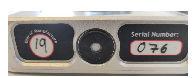
Figure 5 Protective vent on base part of terminal next to the Serial Number.