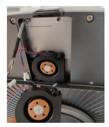
Figure 1 Fans behind fan cover.