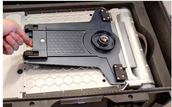
Press both hooks at the same time and make sure the plate gets into position.